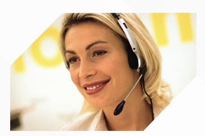
U.S. Cooler prides itself on having real people answer the phone and direct you quickly to someone who can help you.

Time is money and U.S. Cooler® recognizes that. We work to ensure quick delivery to all customers, regardless of their application. We also provide a variety of online services to help save you time and get information at the click of a mouse. You can view in-plant pictures of your product, create a drawing, submit quotes, check order status and receive sizing recommendations, all by visiting our website at www.uscooler.com.